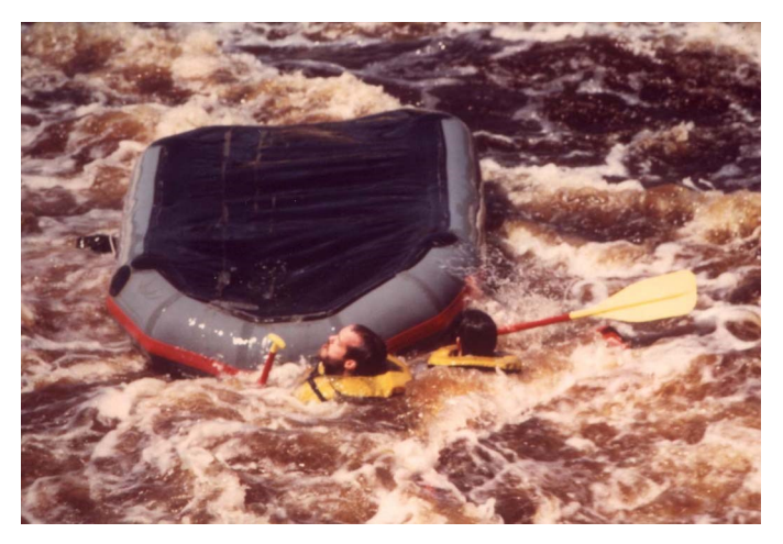
Rafters struggle to get back into their raft after a trip down "Electric Ledge" on the St. Louis River.

One of our guides told us afterward that she had guided whitewater rafting trips in Colorado for five years and had never experienced anything that scary. Many North Stars took up sea kayaking after that adventure.